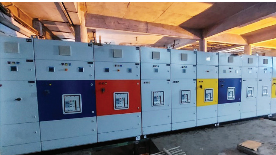
New panels operating generators.