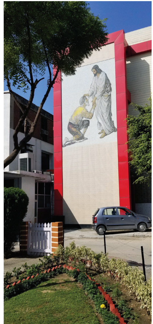
Front of the new multi-purpose building at CMC.