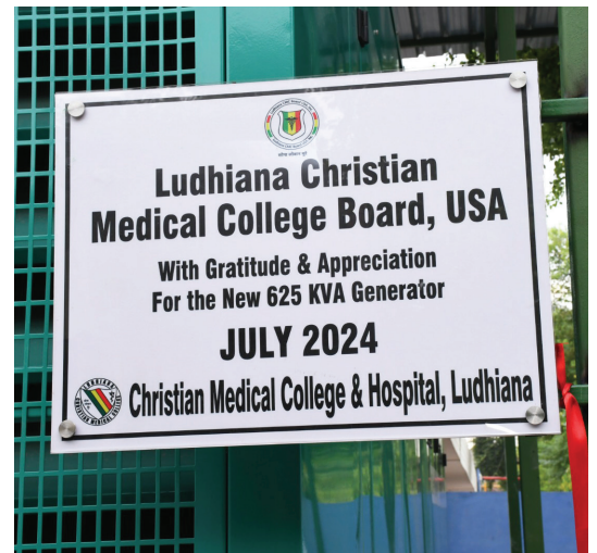
Thanks for donations from all our contributors!