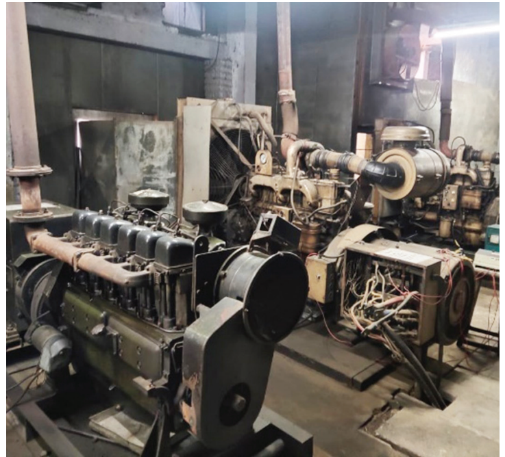
Electrical Generators from the 1970's were all replaced.