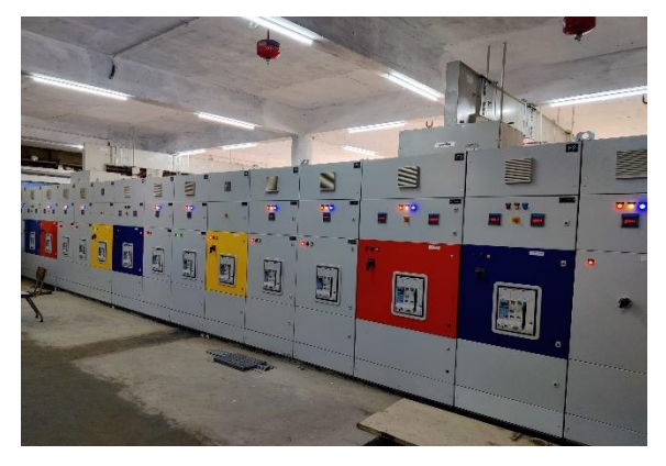
Installed 3 new generator sets in the Electrical Substation