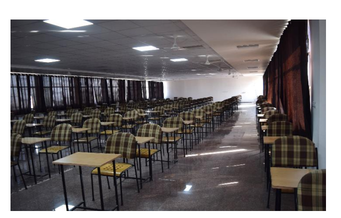
Renovated & installed air-conditioning for Exam Hall