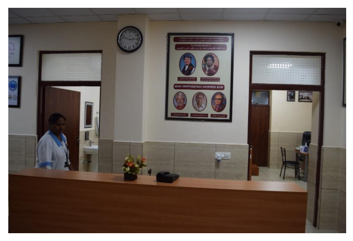
Completed the creation of the Comprehensive Cancer Care & Research Center