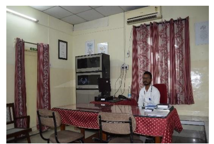
Created a Pastoral Counseling Center within the main hospital serving patients, families and staff.