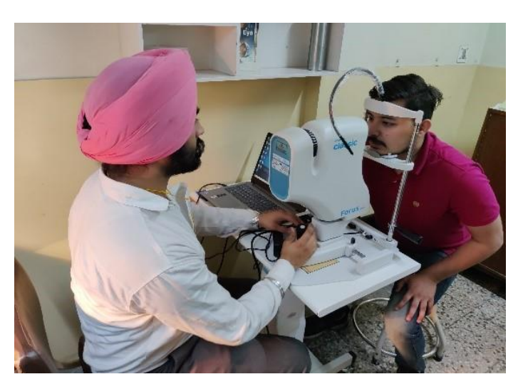
Funded purchase of equipment for Diabetic Retinopahty Screening

As you step in to 2024, please pause for a moment and reflect on the impact of YOUR GIFT. It's beyond measure and transformational.