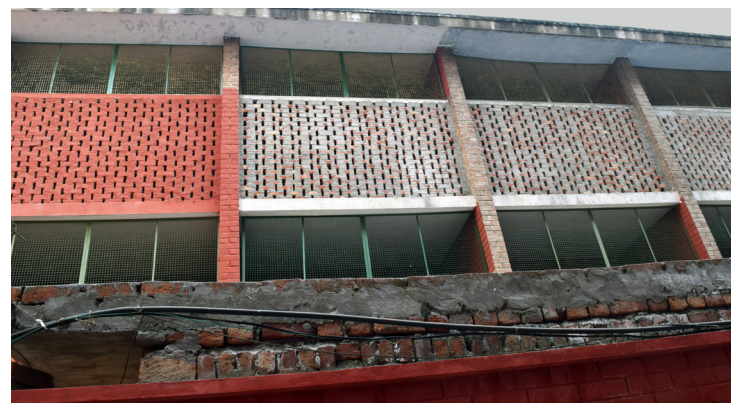
The exterior is also still in need of completion