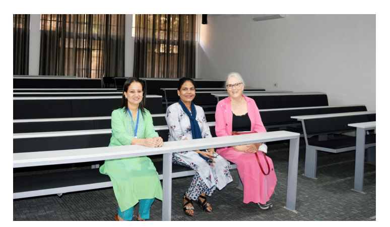
Two new smart classrooms are being constructed for nursing classes.