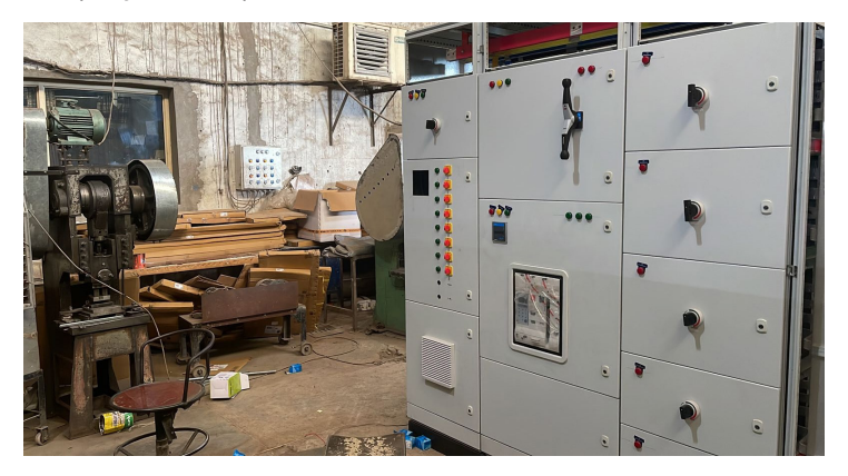
New electrical panels being installed.

In order for the project, which includes phase 3, to be completed another $112,000 is necessary. However, they believe that completing the first 2 phases by the end of December will provide the hospital with safe and reliable electrical supply but the project will need to be finished next year. Any donation you can provide will be useful in getting this project completed.