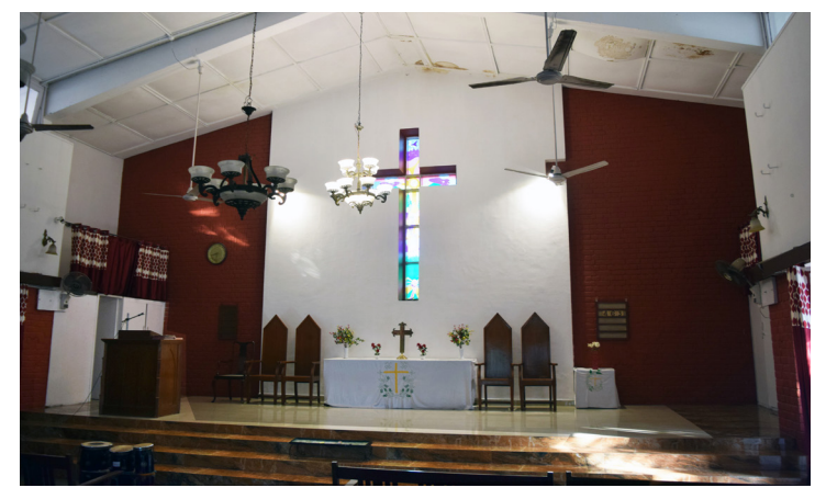
The chapel where morning devotions are held each day is badly in need of ceiling and roof repair. A single donor or group of donors could help with this project.