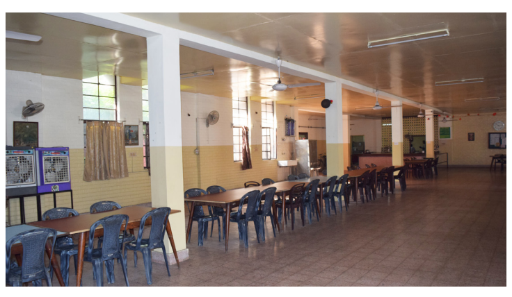
The cafeteria was painted and several items needed for food preparation were purchased.