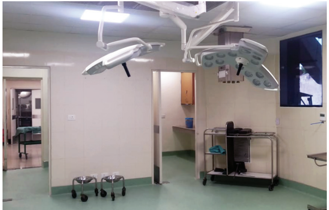
One of the two renovated Feroze Yusufji Operating Theatre rooms.