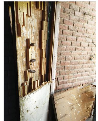
Conditions prior to renovation.

The project has had a difficult time with pandemic labor issues and rainy weather that prevented work getting started. As we are nearing the end of the renovation the students and staff have expressed their appreciation for all that has been done to improve the hostel.