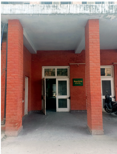
College of Nursing renovated spaces.

The Board is a 501 (c) (3) organization and your gift is fully tax deductible for purposes of U.S. Income Tax.