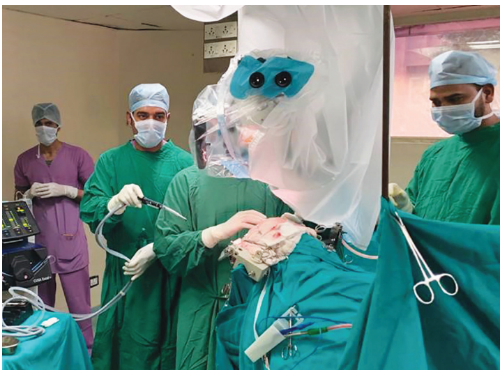
The CUSA Excel+ in use at CMC-Ludhiana's Department of Neurosurgery