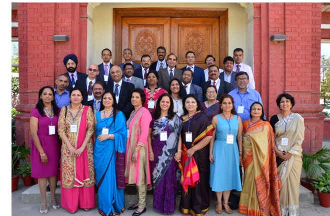
25th Year Reunion - Batch of 1986