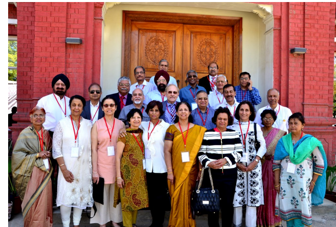
50th Year Reunion - Batch of 1967