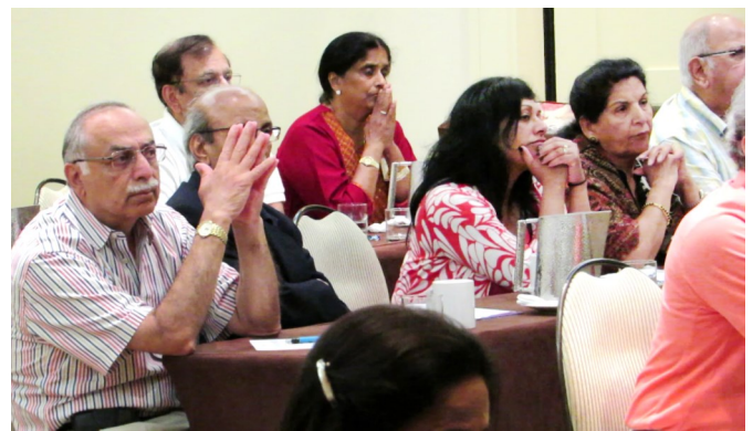
Listening to Continuing Education Lectures