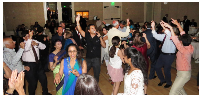
Dancing during Formal Gala Saturday Night